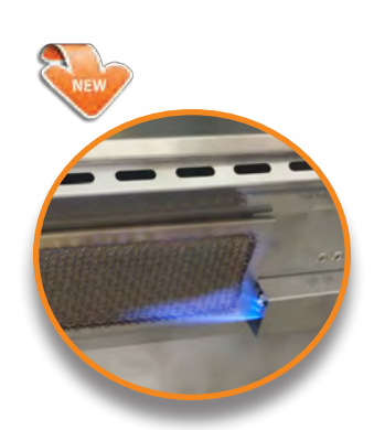
"RAPID-LIGHT" Push-to-light piezo ignition system