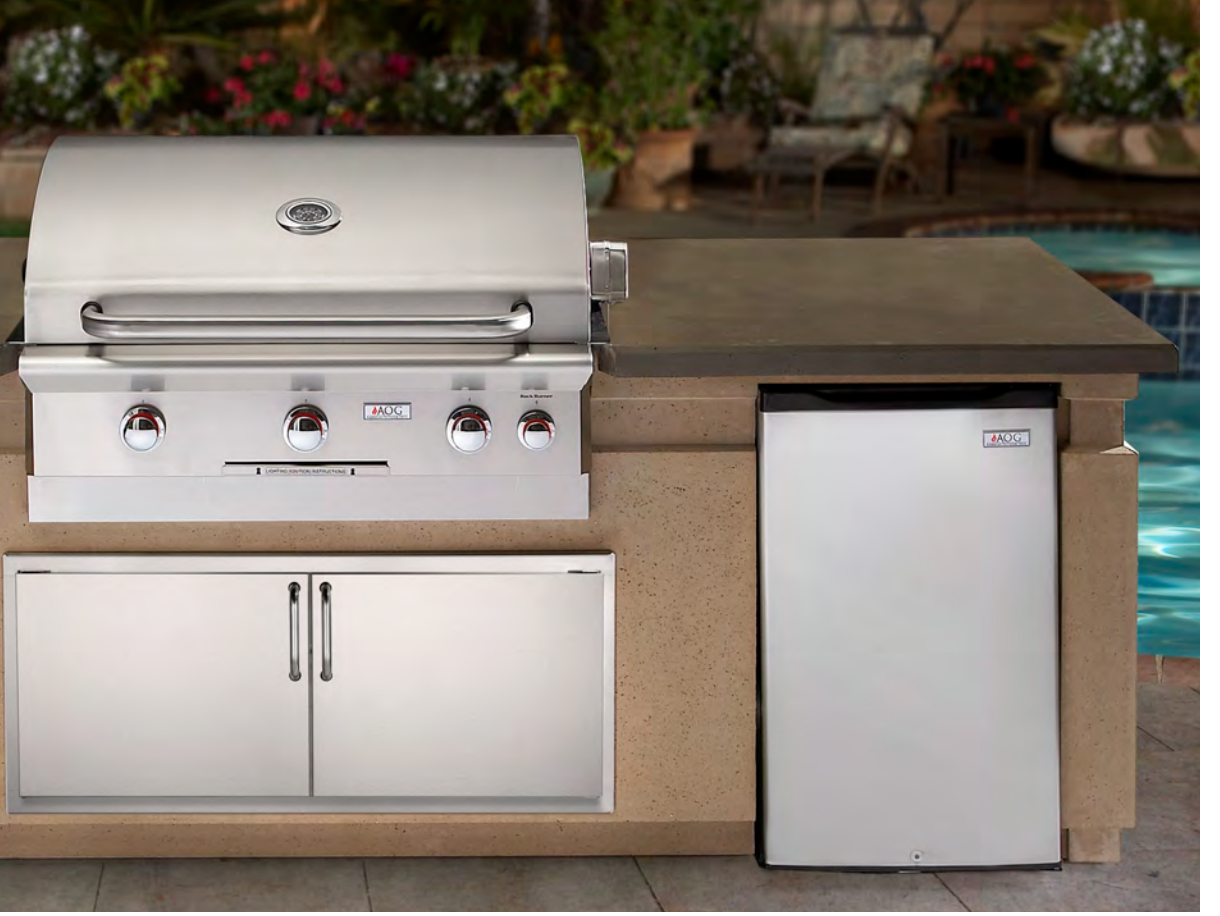
Pictured above: DC790-CBR-108SM Island, 36NBT Grill, REF-20 Refrigerator, & 16-39-SSD Double Access Door