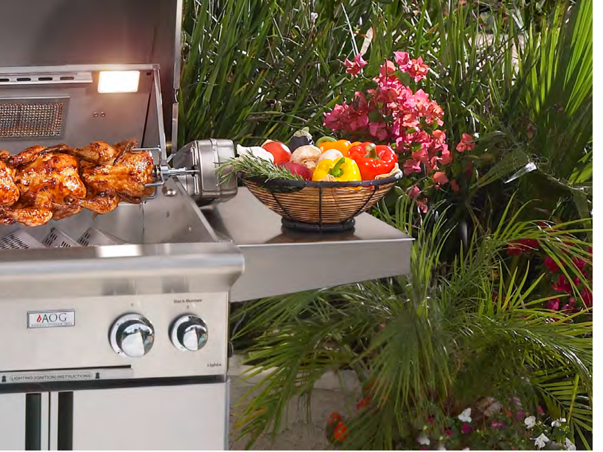
Pictured above: 24PCL Portable grill