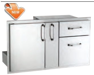
DOOR W/DOUBLE DRAWER & PLATTER STORAGE