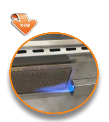
"RAPID-LIGHT" Push-to-light piezo ignition system