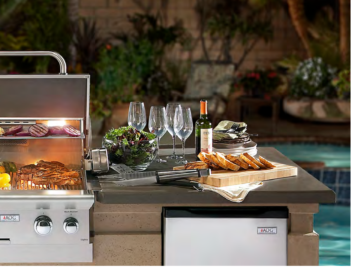
Pictured above: 36NBL Grill, REF-20 Refrigerator, & 3282L Double Side Burner