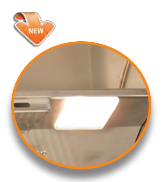
HALOGEN LIGHTS Included with all "L" series grills