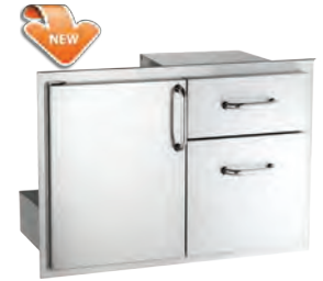
DOOR W/DOUBLE DRAWER